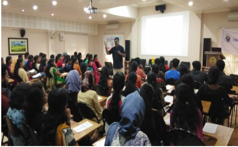
Pgm 4: Seminar on Cyber Crimes