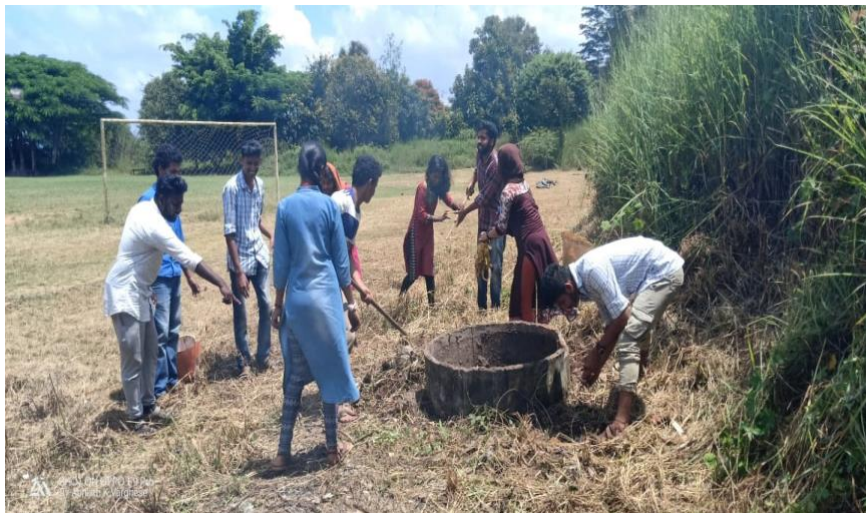
Suchitwa Mission : Campus Cleaning