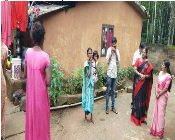
Pgm 5: Colony Visit by Sub judge