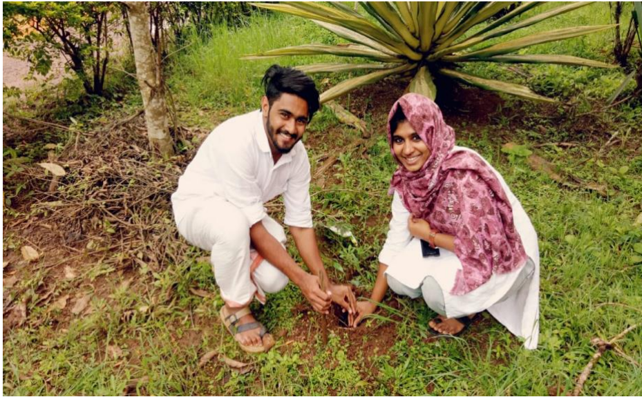
Environment day celebration