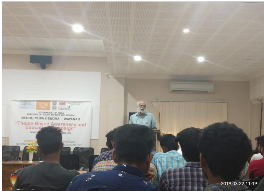
World Earth Day Celebration