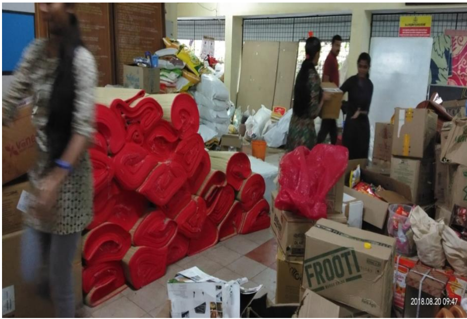
Sorting at Kalpetta collectrate