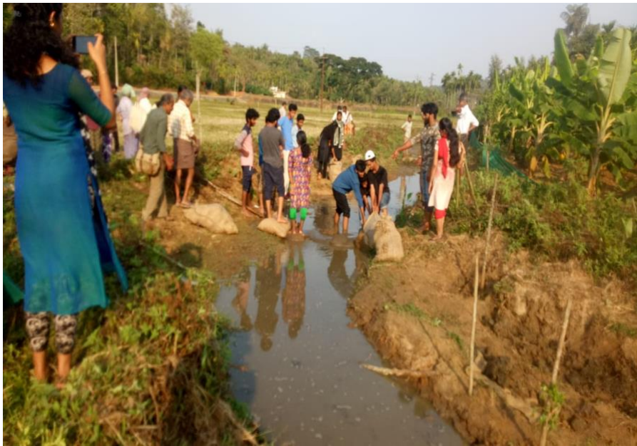
'Theli uravakal' programme