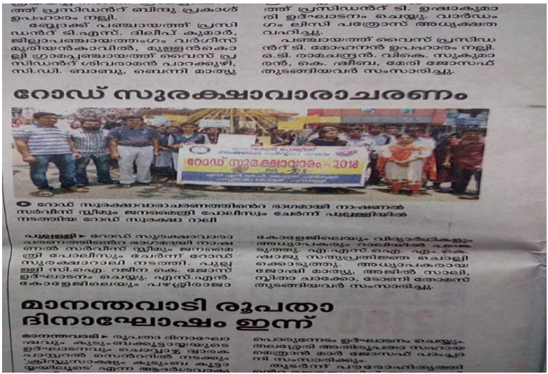
Pgm 1: Road safety week celebration