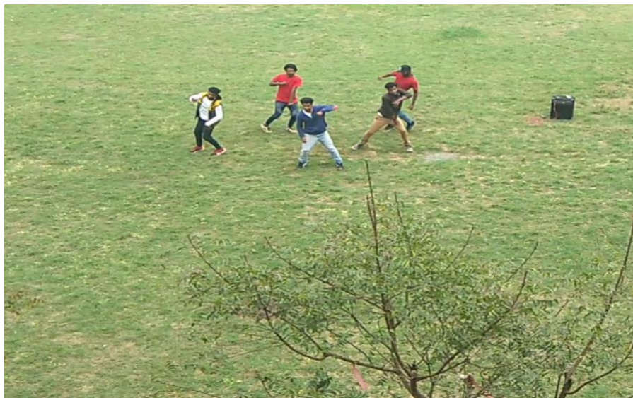
Flash mob for fund collection - eye cancer patients