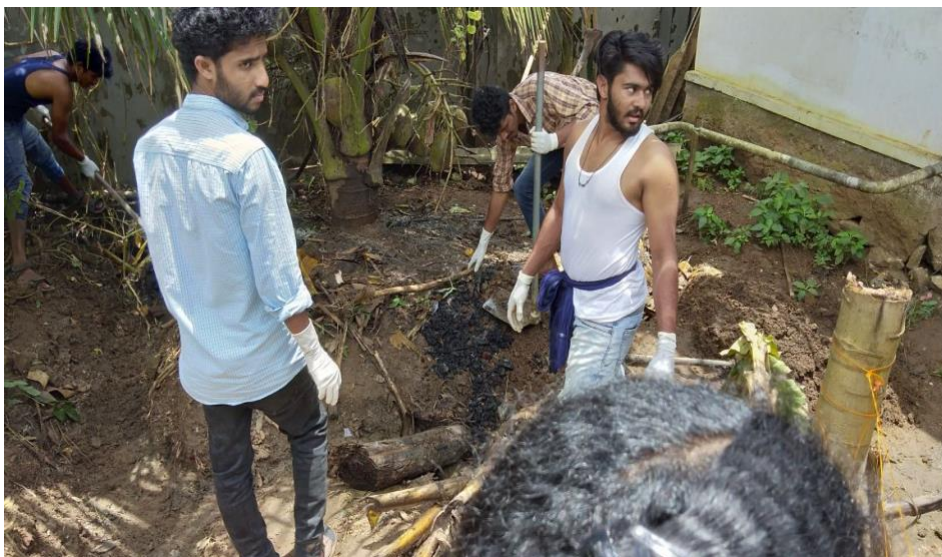
Cleaning Pakkom school site after flood relief camp