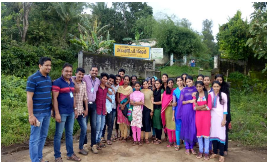
Cleaning Chekadi school site after flood relief camp