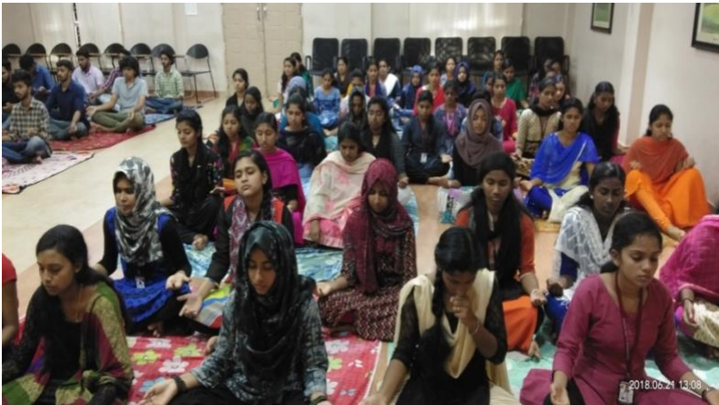
Pgm 3: International Yoga Day Celebration