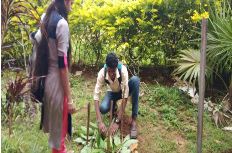
Pgm 2: Environment day celebration